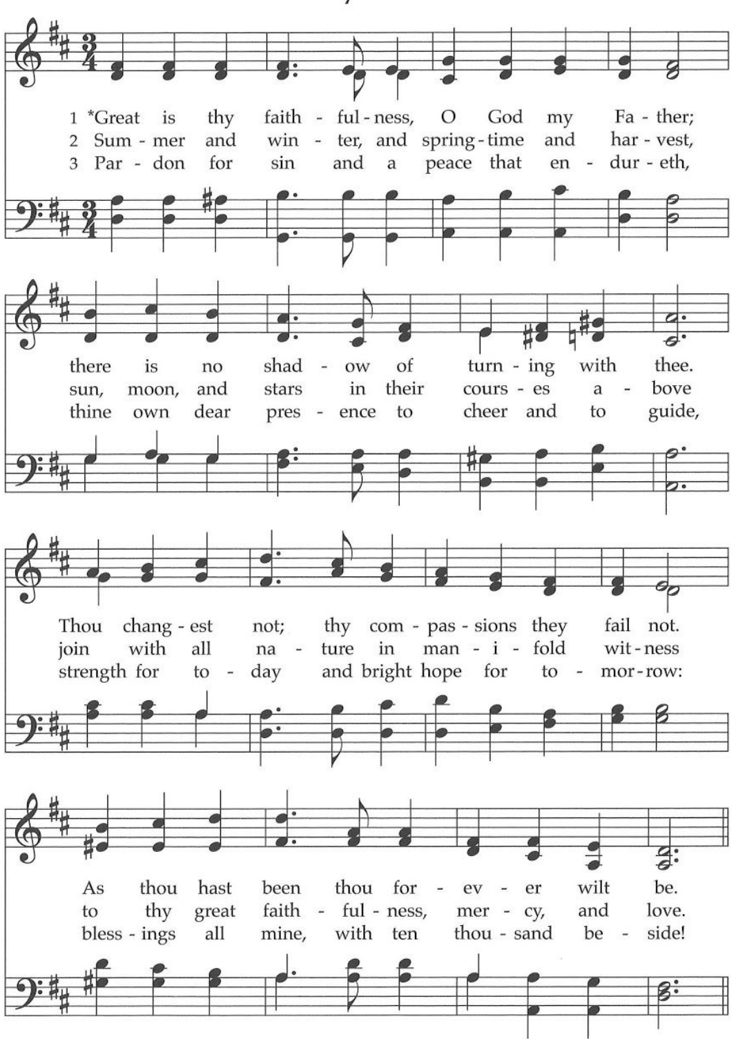
*Or "Great is thy faithfulness, O God, Creator."

Written as a meditation on Lamentations 3:22–23, this text is one of the few hymns among the 1200 poems by this Methodist writer and pastor that has gained much currency. The tune that appears here was composed especially for these words, and the pairing has proved enduring.