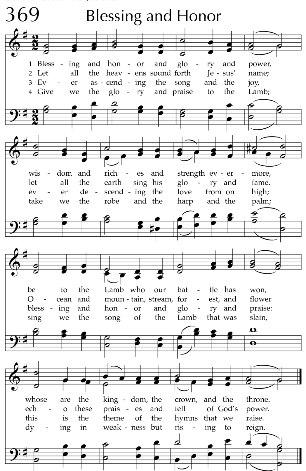
Fittingly titled "The Song of the Lamb" by its author, this hymn is a paraphrase and expansion of Revelation 5:12. It is set here to a resonant French tune of a kind that flourished in the transition from the older chant style to the harmonies and rhythms of modern hymns.