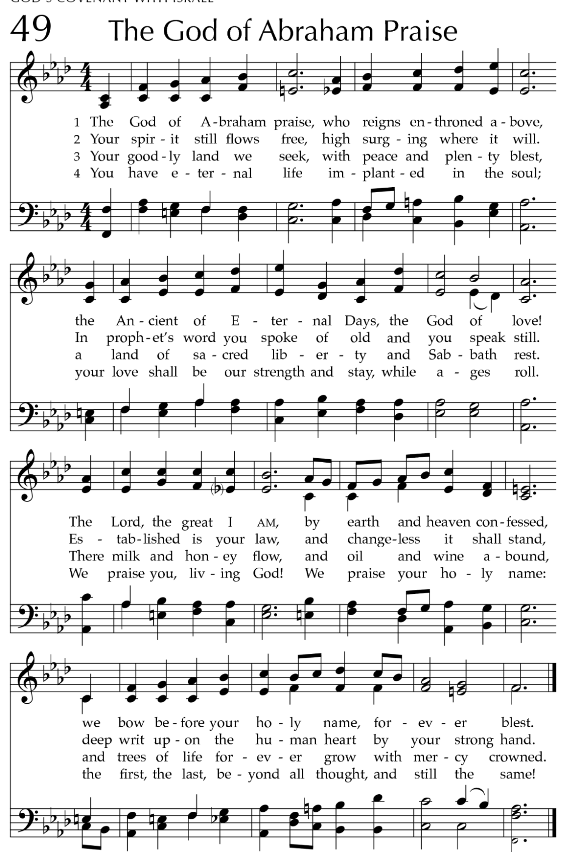
Shaped by its traditional Jewish tune, this selection of English stanzas conveys the essence of the Yigdal , a canticle based on a medieval Hebrew statement of faith about the nature of God and often used in synagogue worship, alternately chanted by cantor and congregation.