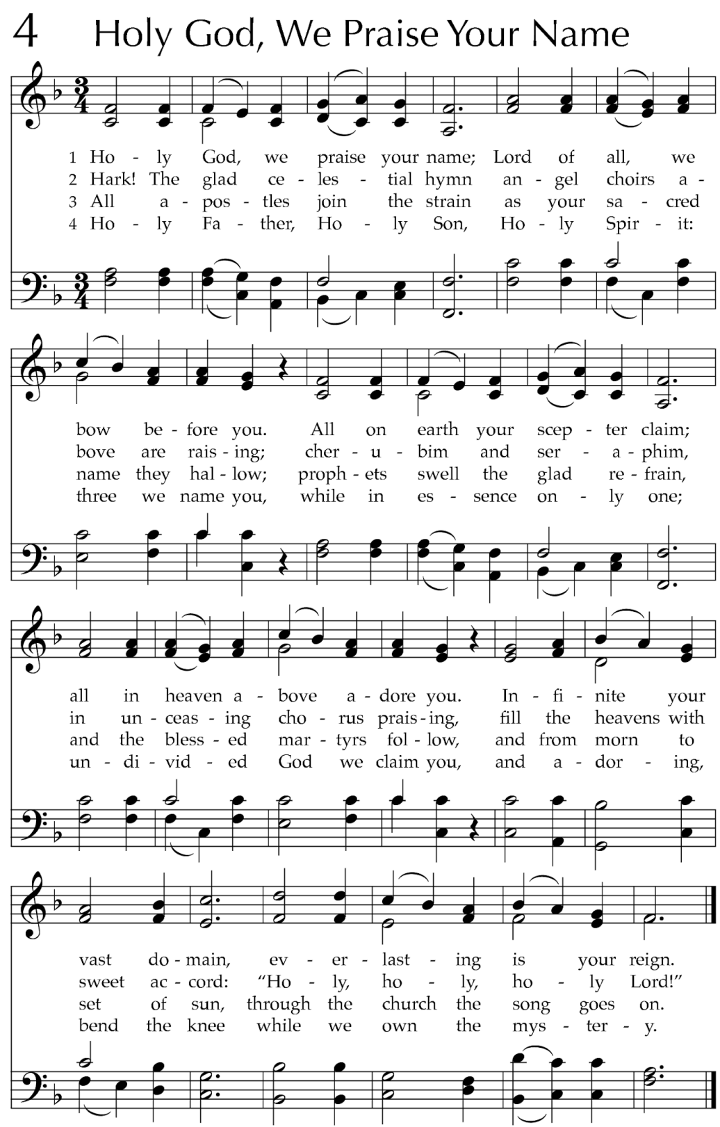
Based on an 18th-century German metrical version of a celebrated 5th-century Latin hymn, Te Deum laudamus , this abbreviated 19th-century English paraphrase is sung by both Protestants and Roman Catholics. It is set here to the tune composed and named for the German version.