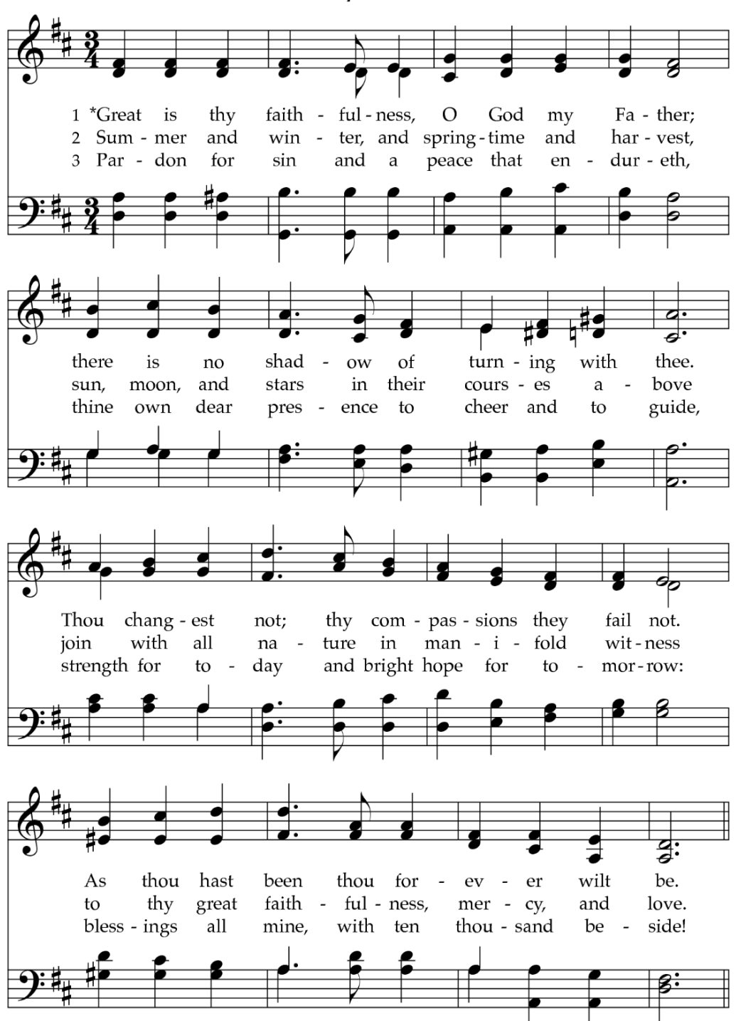
*Or "Great is thy faithfulness, O God, Creator."

Written as a meditation on Lamentations 3:22–23, this text is one of the few hymns among the 1200 poems by this Methodist writer and pastor that has gained much currency. The tune that appears here was composed especially for these words, and the pairing has proved enduring.