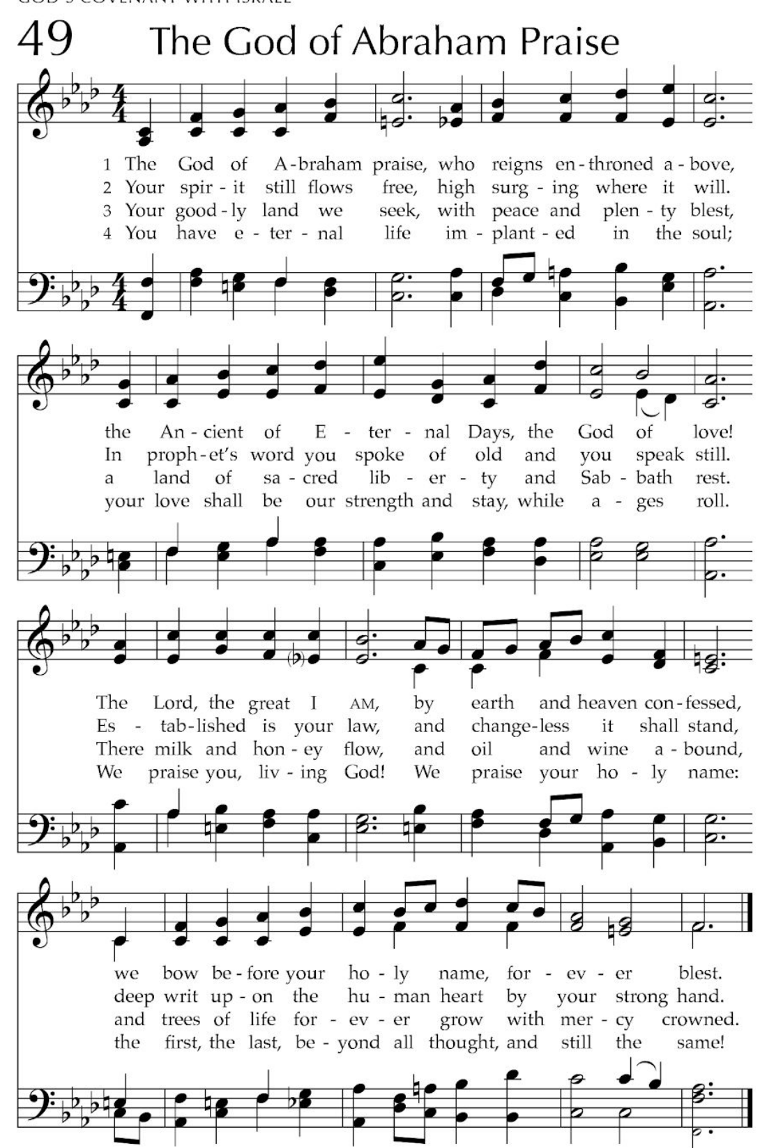
Shaped by its traditional Jewish tune, this selection of English stanzas conveys the essence of the Yigdal , a canticle based on a medieval Hebrew statement of faith about the nature of God and often used in synagogue worship, alternately chanted by cantor and congregation.