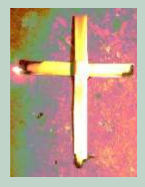
March 6, 2019 5:30 p.m. Dinner and Workshop 6:30 p.m. Service