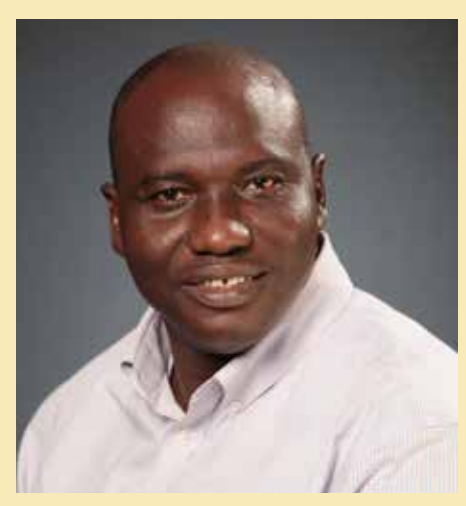
to focus on the widows and the marginalized in my community. I am married with four children with ages 20, 17, 13 and 9.