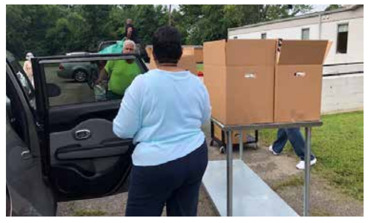
From prepping supplies for distribution to handing prepared packages of groceries, volunteers from both Peace and Second Presbyterian churches work together to provide nutritional support to the community.