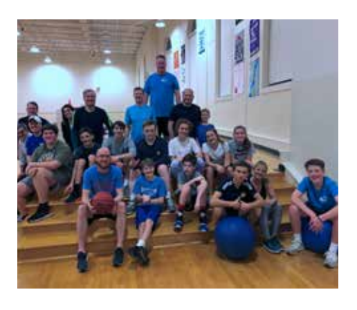
Open Gym is a great time for fellowship and fun!

The youth committee wants Open Gym, Ski Trip, and Montreat to happen. But we ask for understanding as we do our best to discern the best way forward amid our ever-changing circumstances. No matter what, know you are loved by your church family and are in our thoughts every day. We will do our best to communicate updates as quickly as we can, so you are informed.